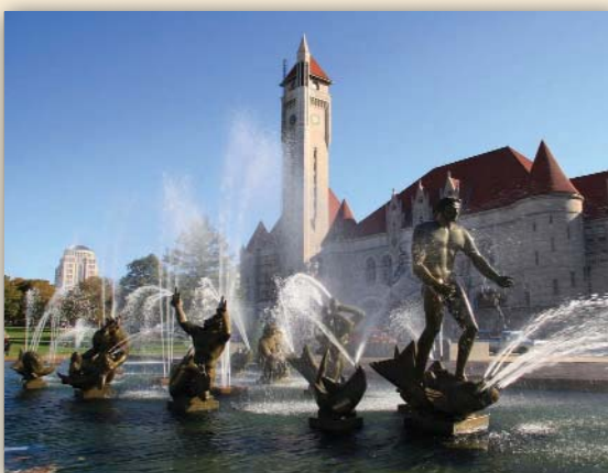
Union Station in St. Louis