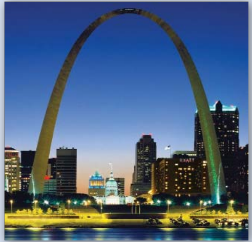
Hyatt Regency St. Louis Riverfront Skyline

The Hyatt Regency St. Louis Riverfront in St. Louis, Missouri, is the site of the Bureau of Justice Statistics/Justice Research and Statistics Association's 2009 National Conference. Located in downtown St. Louis, the Hyatt is convenient to restaurants, attractions, and night life.