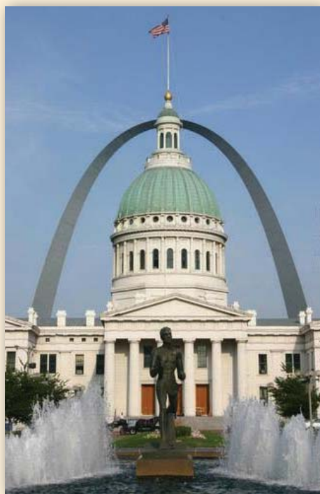
St. Louis Gateway Arch & Old Courthouse