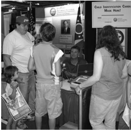
Children receive fingerprint identification cards from the Attorney General's Office at the Ohio State Fair.

This Web site is the official Internet source for Ohio missing children information for law enforcement. This application is a critical missing child response program that utilizes the resources of law enforcement agencies and media to notify the public of abducted and endangered children. This application is dedicated to keeping the law enforcement and the public informed about currently activated Alerts. Public awareness to Alert information is intended solely for the edification of the public and the safe return of abducted children.